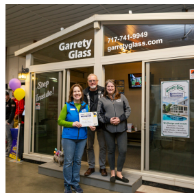
Top Row, Shown from Left to Right: Winner of Best Booth in Building 9, Casey Fence & Deck Winner of Best Booth in Building 12, Strat Security Winner of Best Booth in Building 13, Outdoor Solutions, LLC Bottom Row, Shown from Left to Right: Winner of Best Booth in Building 14, Classic Home Advisors Winner of Best Booth in Building 14A, Bartz Landscaping Winner of Best Booth in Show, Garrety Glass