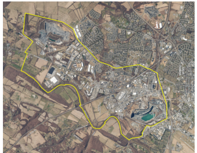
Boundary lines: New Design Road to below Metro Landscape & Construction to Monocacy River to Reichs Ford Road to I-70 back to New Design Road.